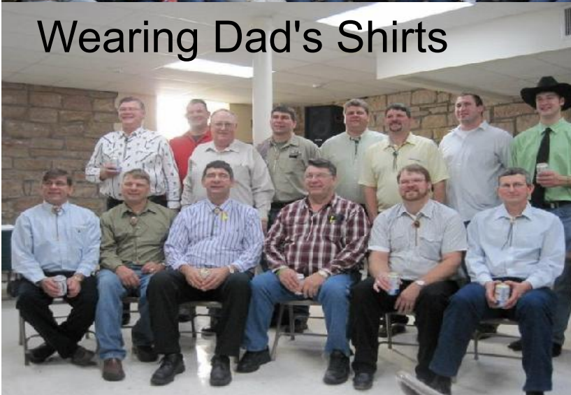
Wearing Dad's Shirts