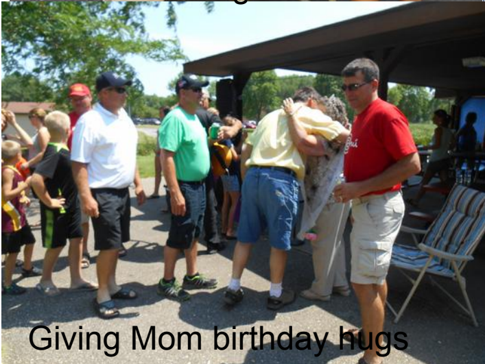
Giving Mom birthday hugs