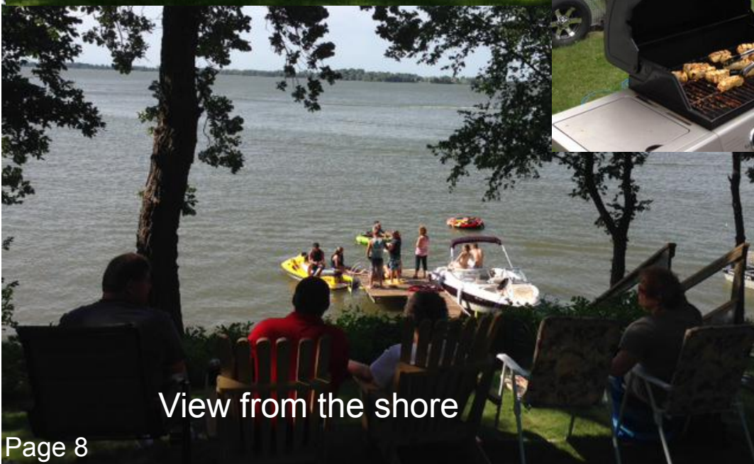
View from the shore