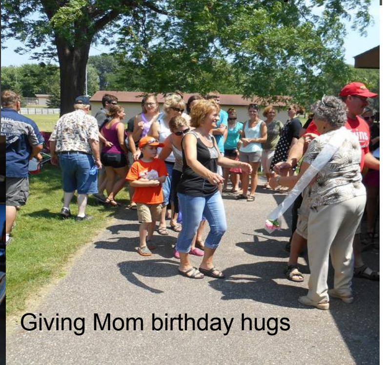
Giving Mom birthday hugs