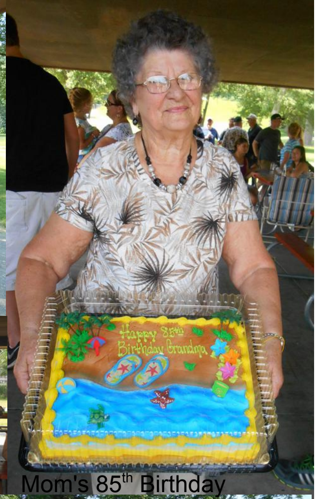
Mom's 85 th Birthday