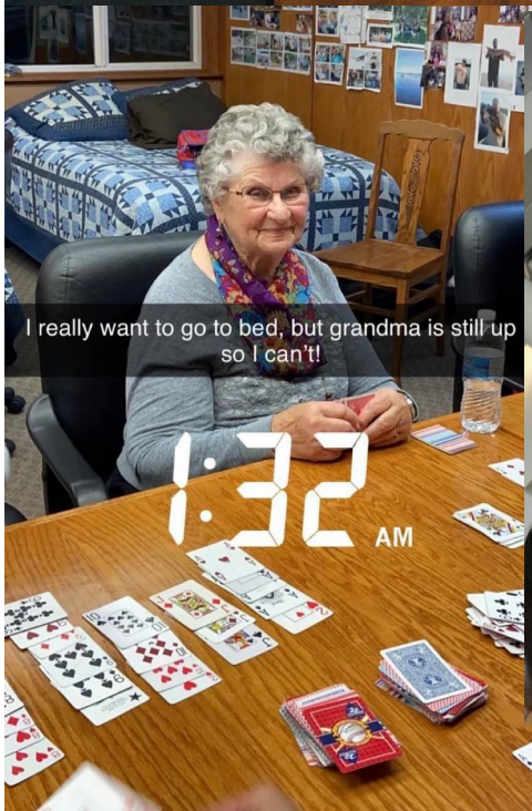
I really want to go to bed, but grandma is still up so I can't!