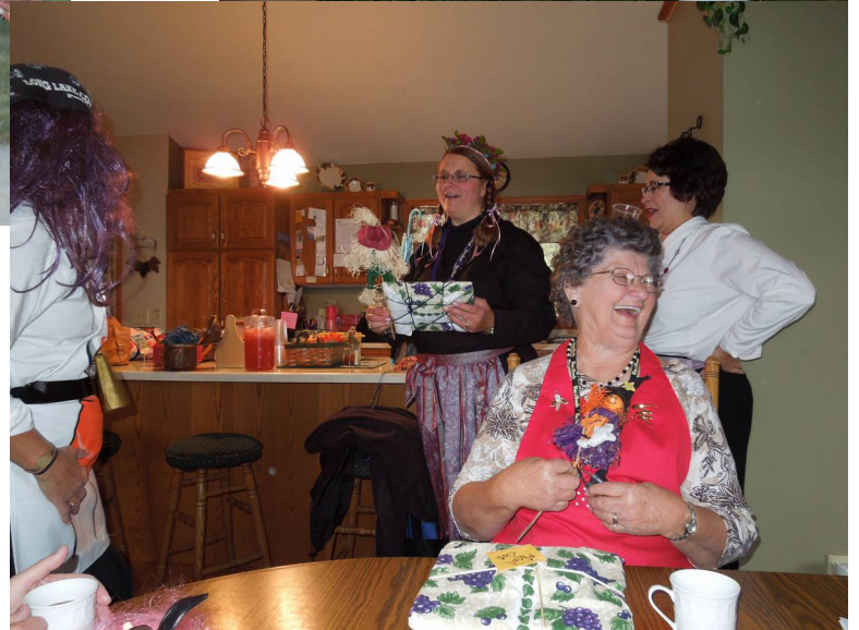
Photo above is Mom having a great laugh which she did often. Photo to the left is Mom is our Queen at Sister's Weekend.