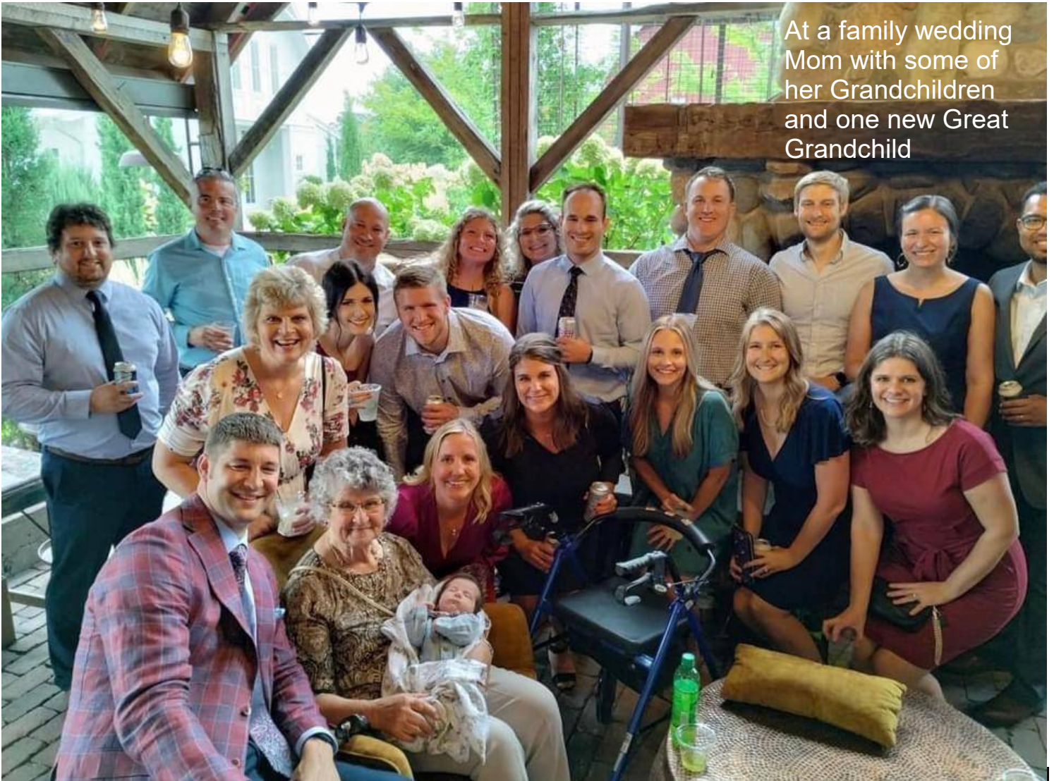
At a family wedding Mom with some of her Grandchildren and one new Great Grandchild