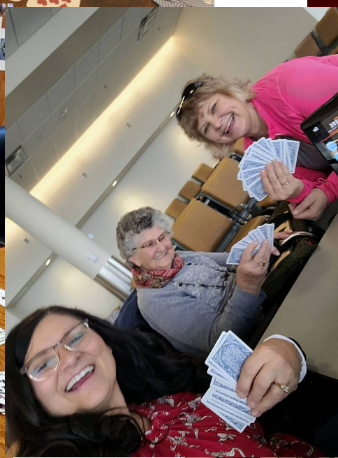
The photo at the middle left is Mom playing Hand and Foot at Sister's Weekend. The photo at the left middle is playing cards in the airport waiting to board.