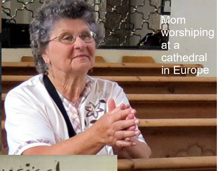
Mom worshipping at a cathedral in Europe