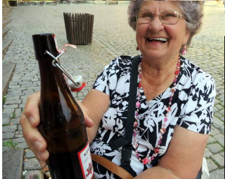
Mom having some refreshments in Germany