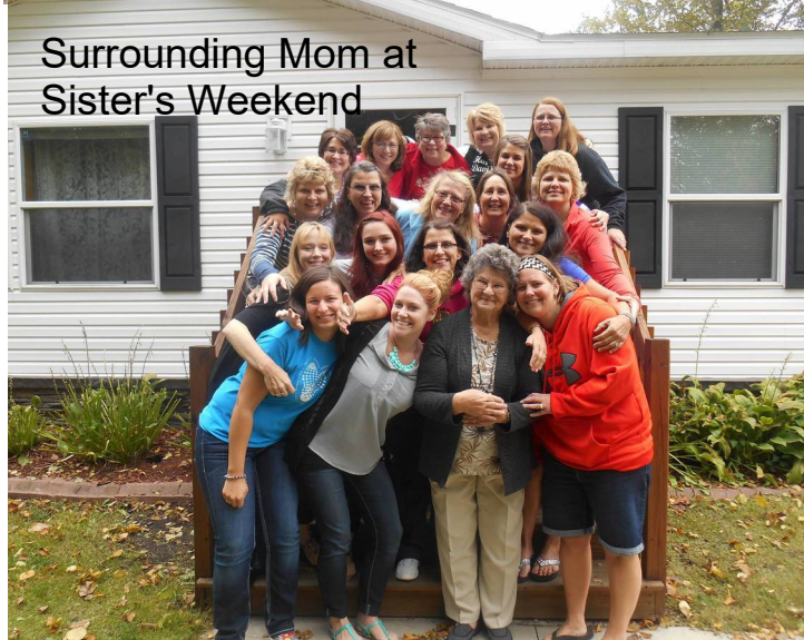
Surrounding Mom at Sister's Weekend