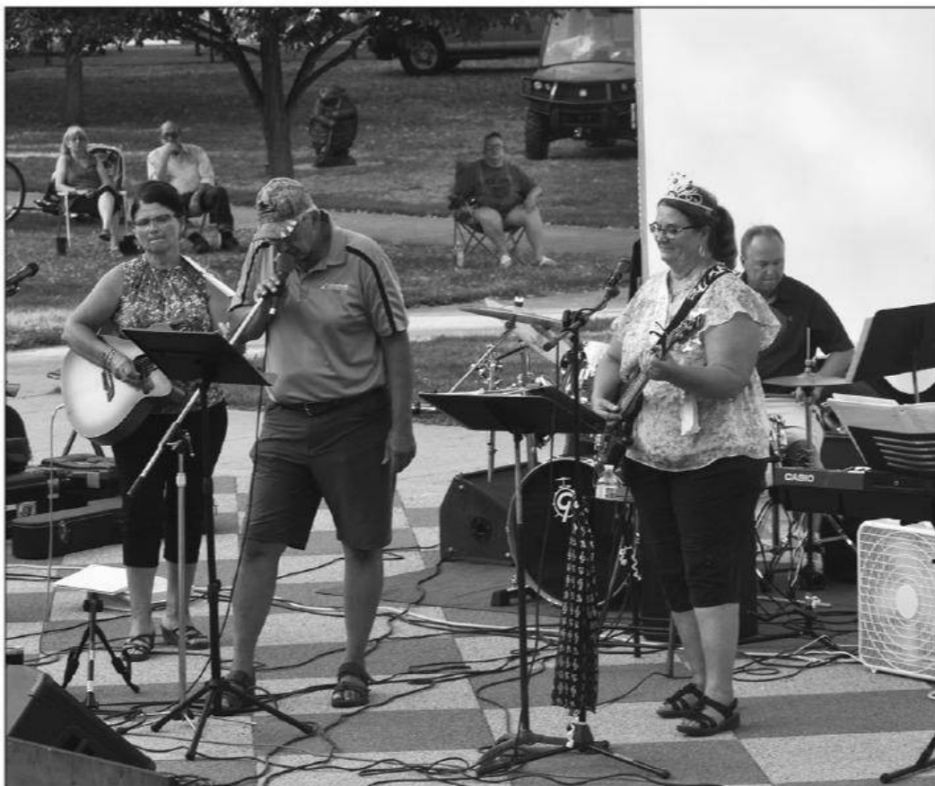
The Black Diamond Band followed the Mages Family Band for the Music in the Park event.

The "Black Diamond Band" played songs such as "Have You Ever Seen the Rain" by "Creedence Clearwater Revival" and "Can't