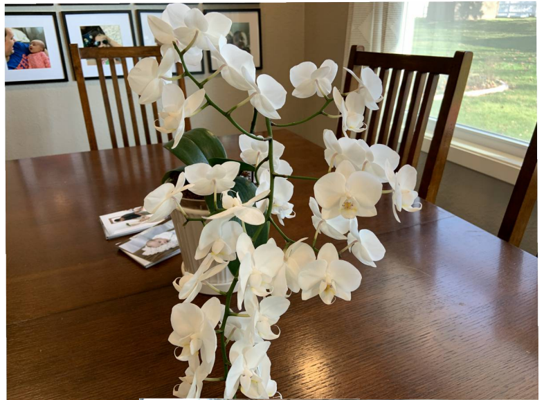
Cody's beautiful Orchids he grows himself