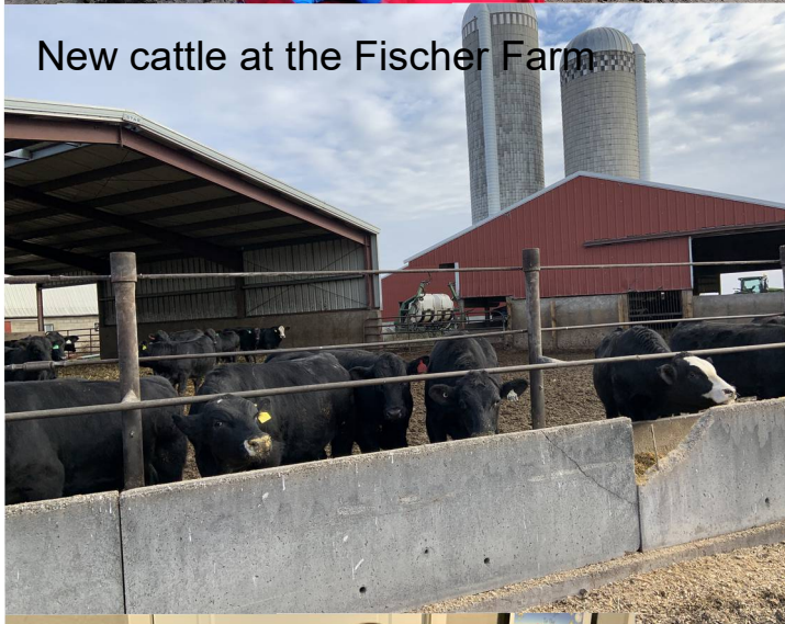
New cattle at the Fischer Farm