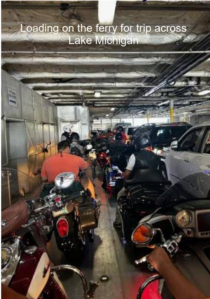
Loading on the ferry for trip across Lake Michigan