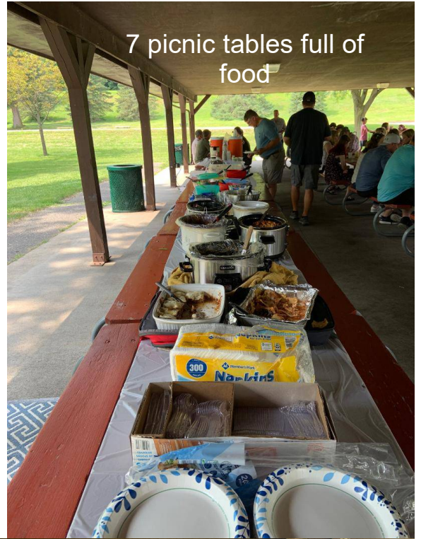
7 picnic tables full of food