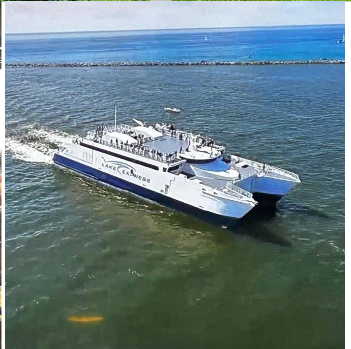
The ride across Lake Michigan